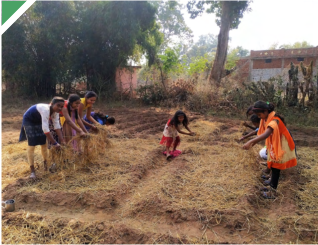
Cultivating indigenous vegetables

Strengthening relationships, finding hope