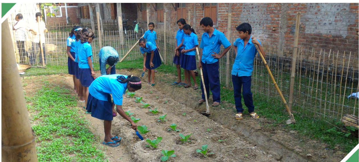
Students of Mohanating High School tending their garden