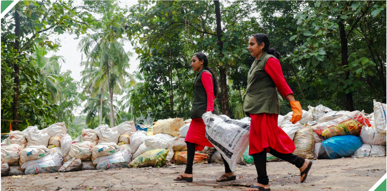
Haritha Karma Sena (SHG women) of Chaliyar Gram Panchayat taking waste to their Material Collection Facility