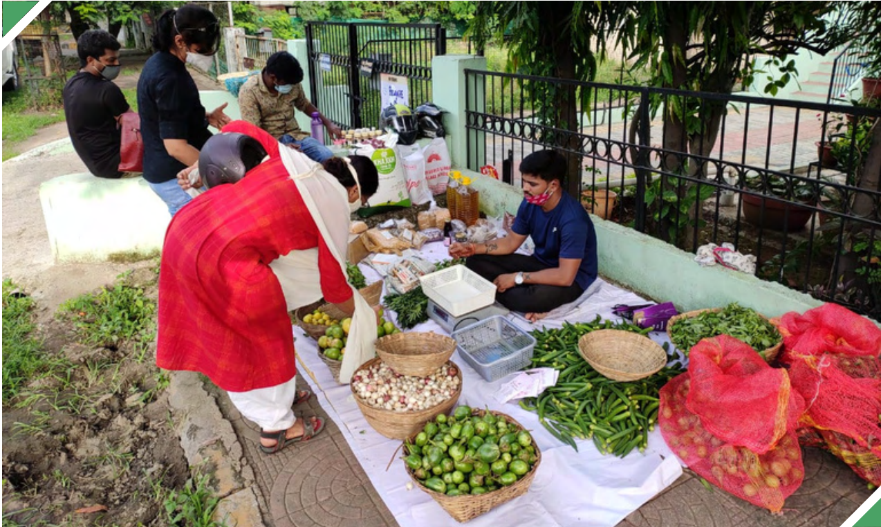
The makeshift vegetable shop on the pavement set up following COVID-19

Strengthening relations between farmers and consumers