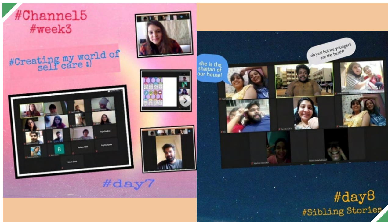
Online sessions of Channel 5

The Blue Ribbon Movement (BRM) is a Mumbai based youth-led movement that works on building youth leadership and connected communities for a better world. It believes in the principles of deep democracy, and practices 100% consent-based decision making.