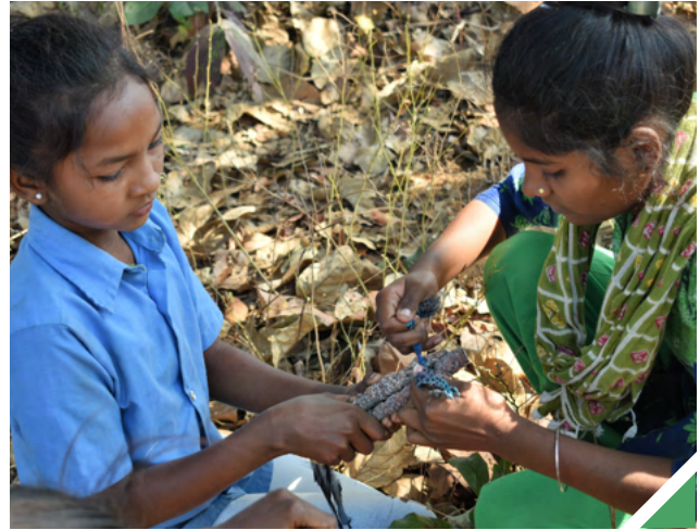
Making brood lac bundles

'Chinhari: The Young India' is a collective of largely young women (not to the exclusion of men though) that works towards reconstructive praxis in remote locations of Chhattisgarh. The work engages with approximately hundred young women and men in five villages in the districts of Dhamtari and Kanker. Chinhari has been working on learning from sustainable ways of living and works towards habitable village life. Chinhari finds its drive in democratic ways of functioning and aims to work with the help of collectives (rather than single individual heads). In the last few years, Chinhari has collectively worked on questions of: