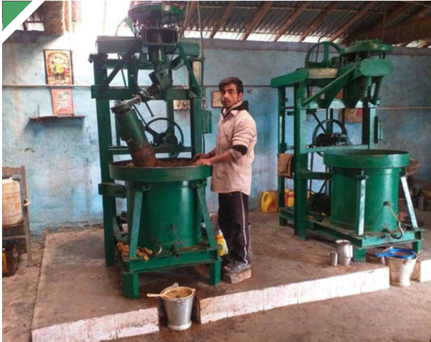
Cold press oil manufacturing plant installed in Bihar

Facilitating rural livelihoods for migrant labourers