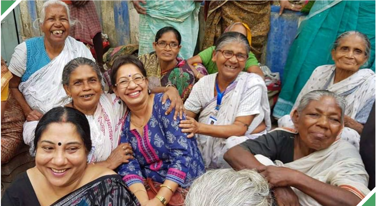
Moments of love and joy