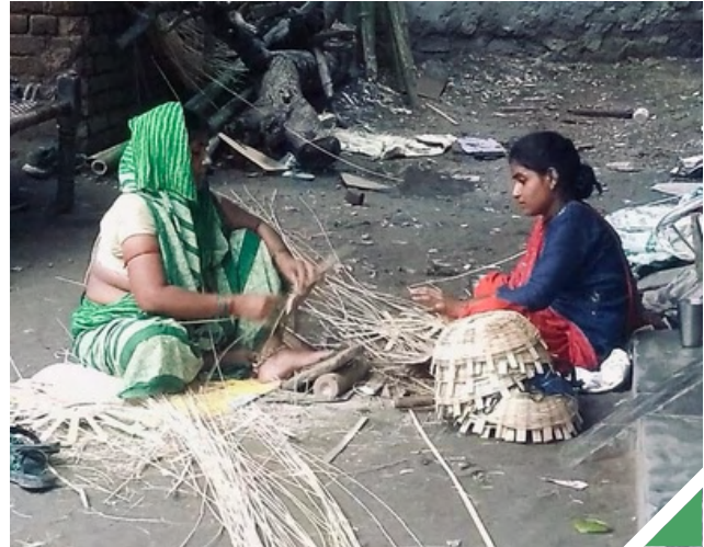
Women in Faridabad making bamboo baskets

The national lockdown left the majority of the migrant labourers in the country stranded without basic support and left them undignified. The inequity that played out in the times of the pandemic was what prompted Bilal Khan, a young 29 year-old housing rights activist based in Mumbai, to address the issue. The initial phase starting from March 2020 was of firefighting, doing relief work that was required immediately and urgently. This included getting material resources including food and access to healthcare for the needy during the lockdown period.