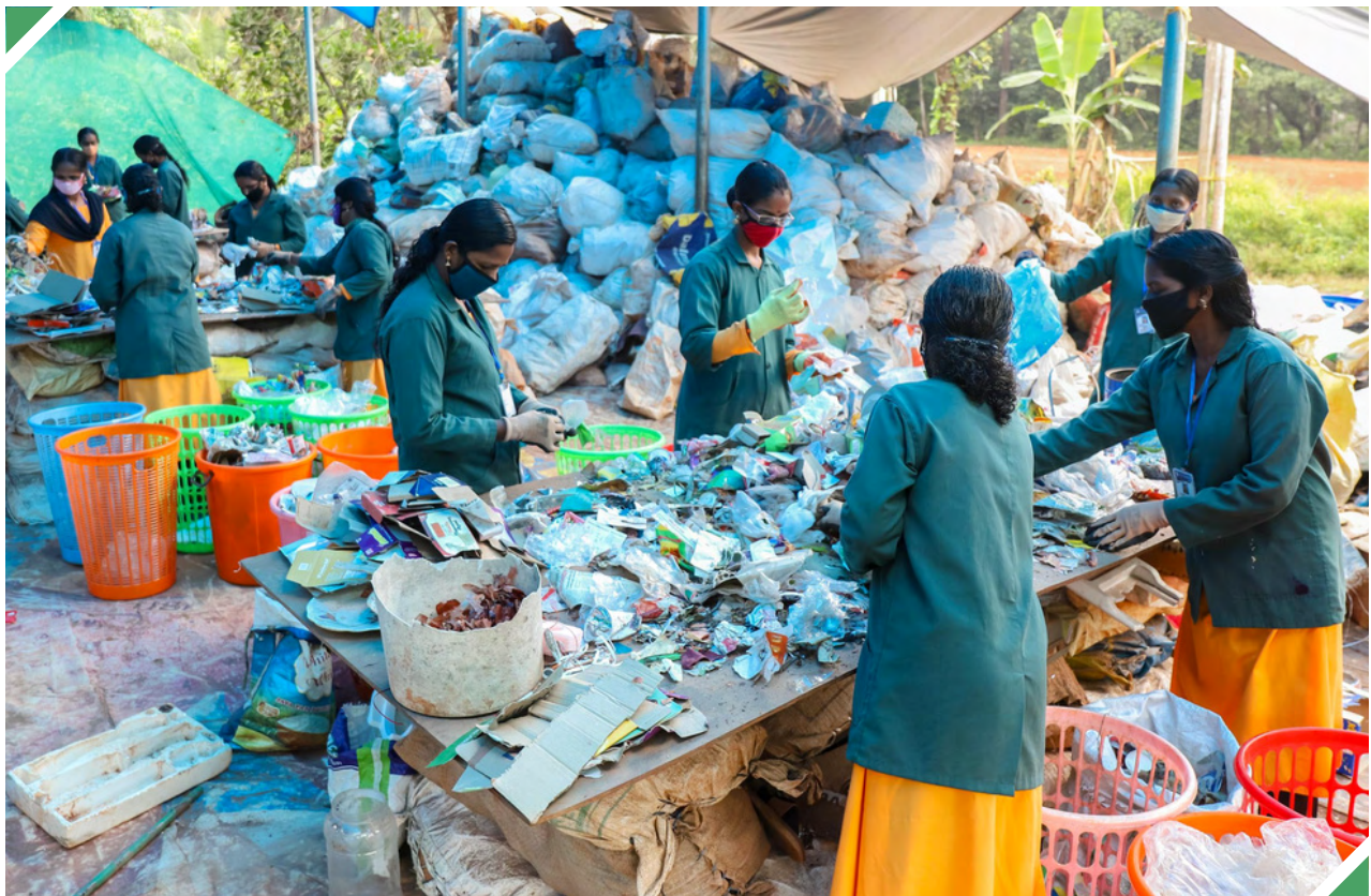
SHG women of Pulpatta Gram Panchayat segregating waste at their material collection facility