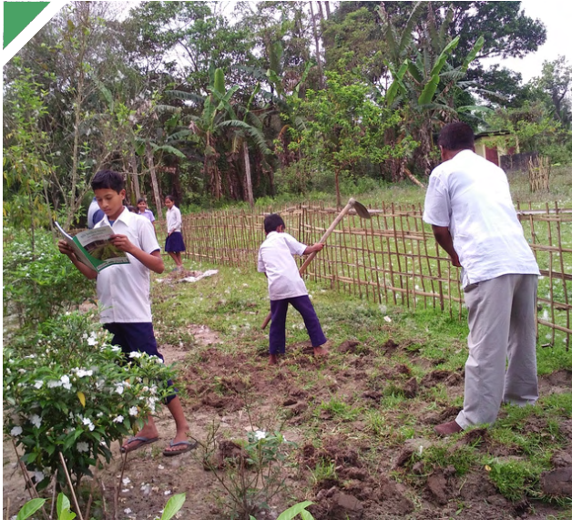
Work and Study at Alengmora High School

Farming for future, farming for resilience